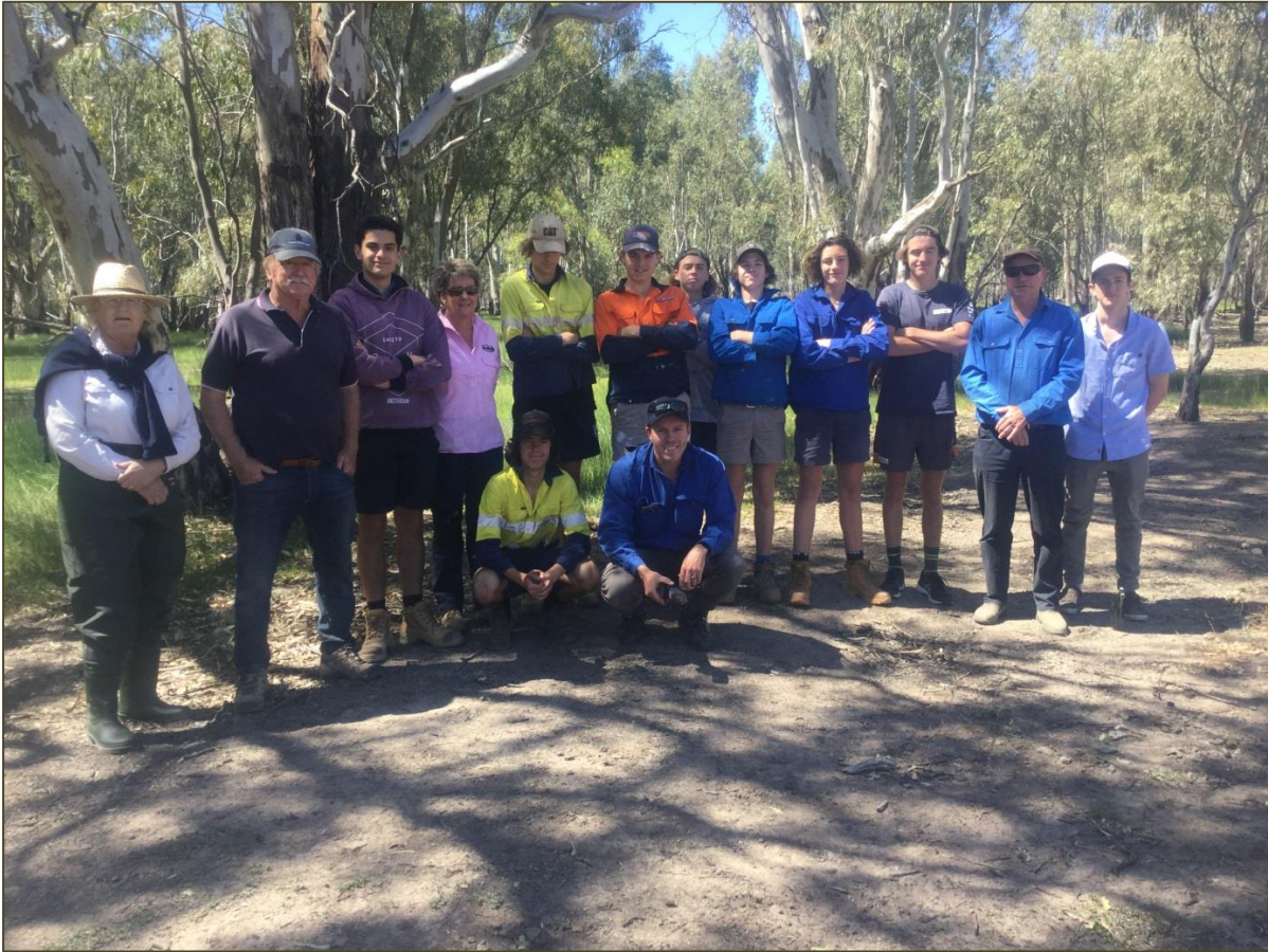
Figure 1: Tour party at the start of the day