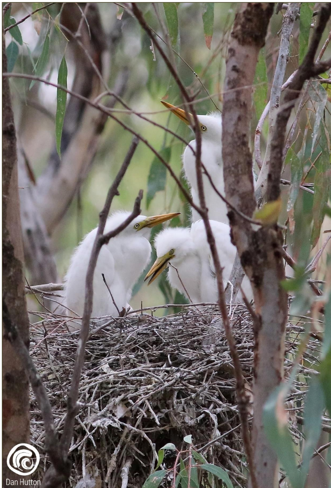
Figure 3: Intermediate egret chick are now all hatched