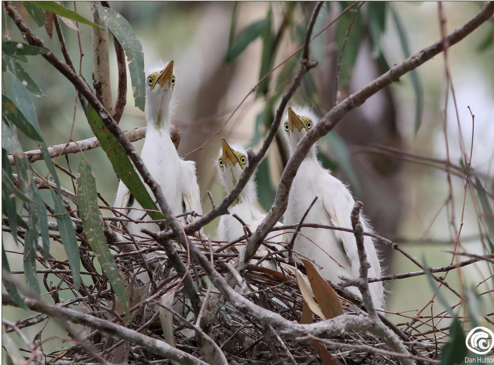
Figure 4: Intermediate chicks