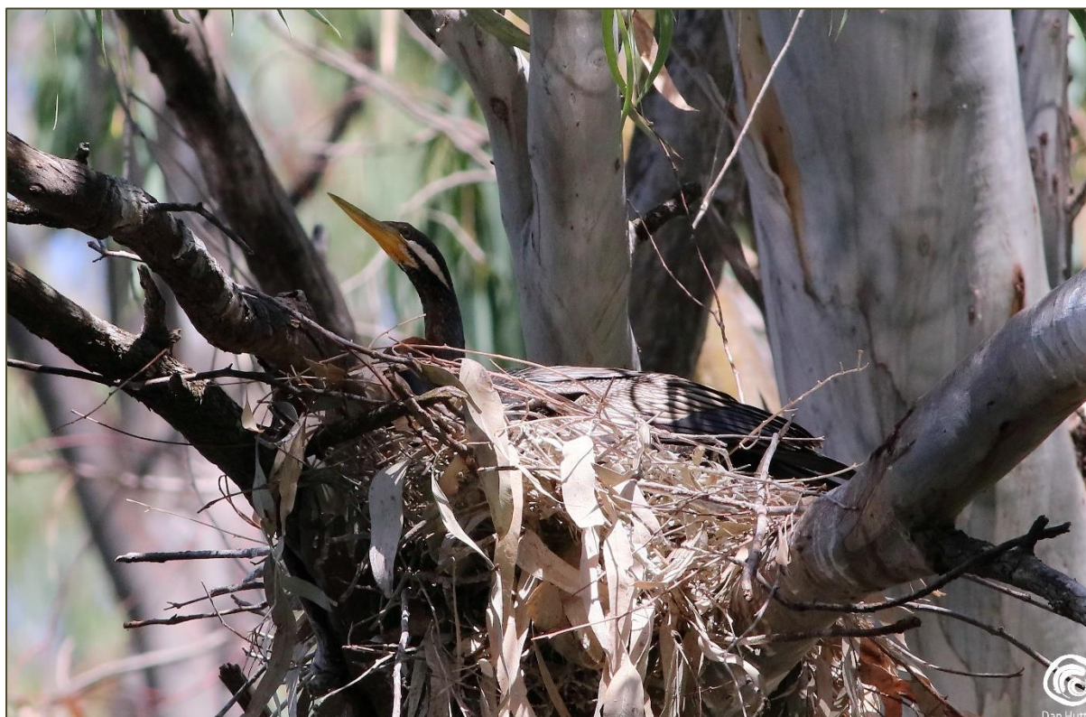
Figure 3: Australian Darters were late arriving and nesting this year.