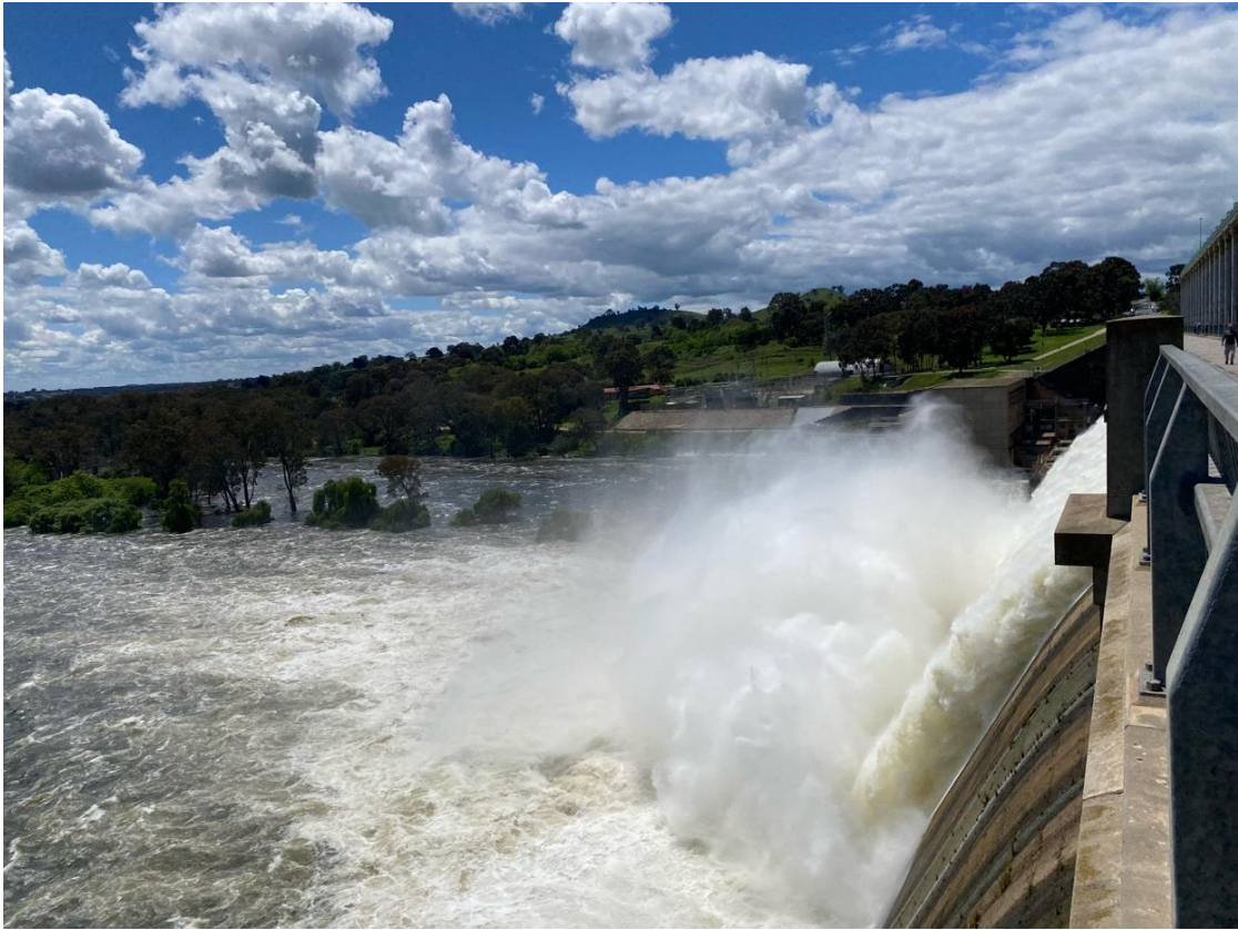
Figure 4: Hume Dam 4 th November 2022