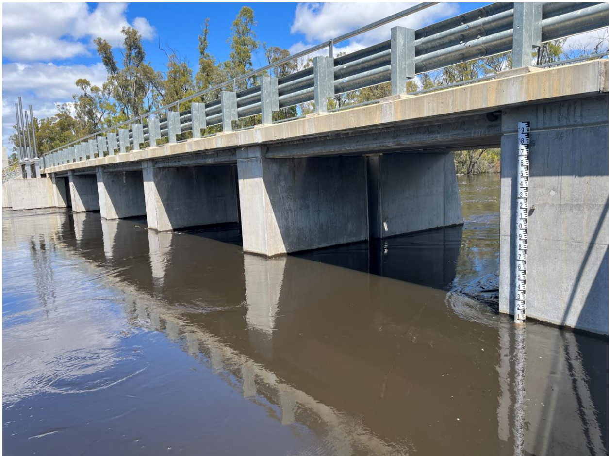
Figure 3: Barbers Regulator height, 4 th November 2022