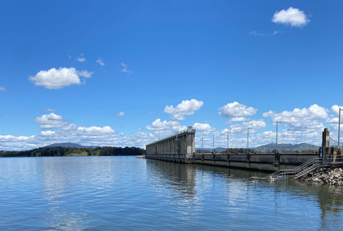
Figure 5: Hume Dam 4 th November 2022