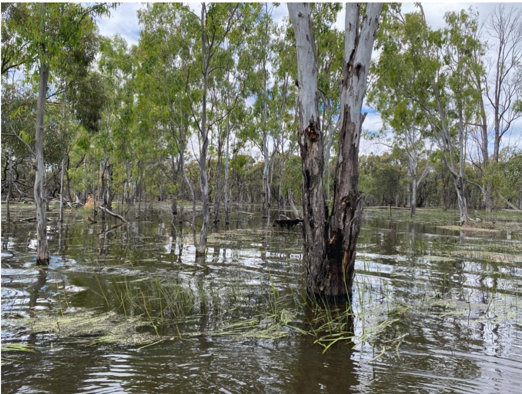
Figure 4: Koondrook-Perricoota Forest 23rd November 2022