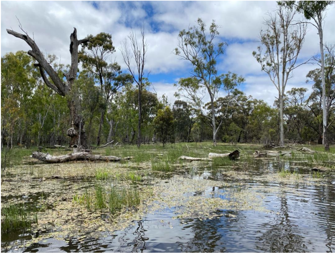
Figure 3: Koondrook-Perricoota Forest, Belbins Rd 23rd November 2022