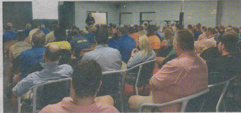
More than 100 people attended a feedlot information day at the Wakool Club last month. Pictures supplied.

of Sheep Solutions, presented the workshop material, discussing the topics of feedlotting versus containment feeding, cost of feed and comparison of different systems.