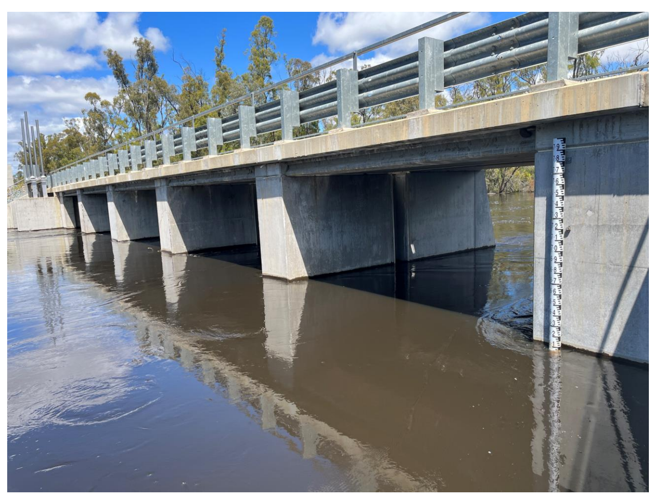
Figure 3: Barbers Regulator height, 4<sup>th</sup> November 2022