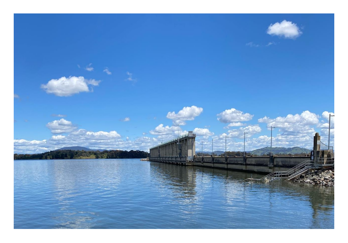
Figure 5: Hume Dam 4<sup>th</sup> November 2022