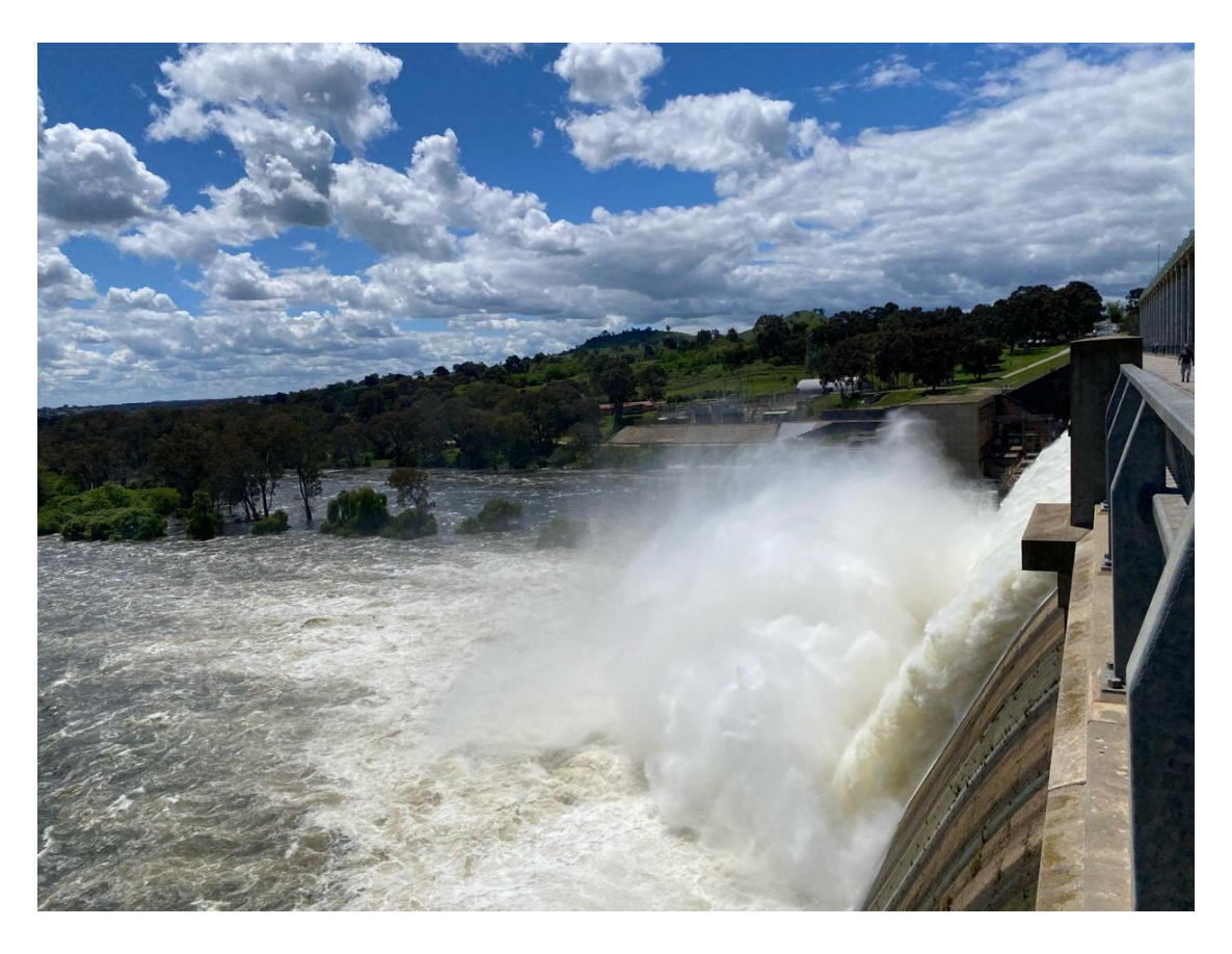
Figure 4: Hume Dam 4<sup>th</sup> November 2022