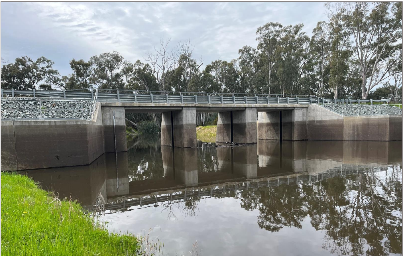
Figure 5: Thule Creek Regulator 7/09/2022