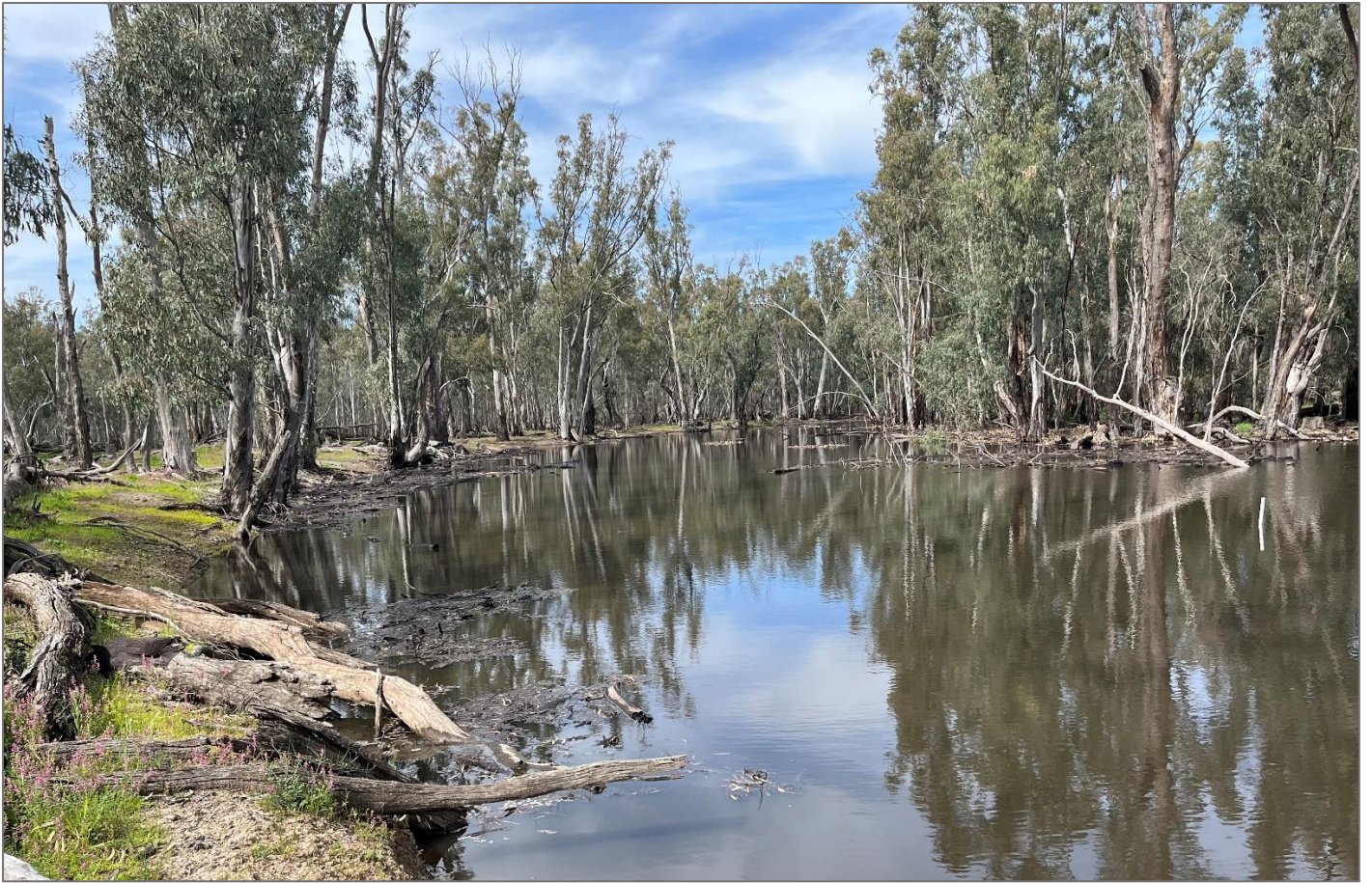
Figure 4: McMahon's Waterhole 7/09/2022